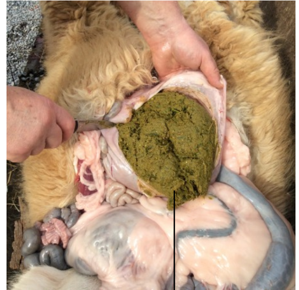
Rumen Content for Transfer

It's worth mentioning that the reason for being "off feed" should be addressed prior to the transfaunation. It's doubtful that the transfaunation will be of value if the recipient is suffering from e.g. parasite overload or gastric ulcers. I also give Vitamin B complex injections at the time of the transfer. The transfaunation can be repeated daily for several days. Most transfaunation failures occur with inadequate donor fluid levels, not maintaining an anaerobic environment, concomitant use of antibiotics and inadequate length of transfaunation fluid treatment.